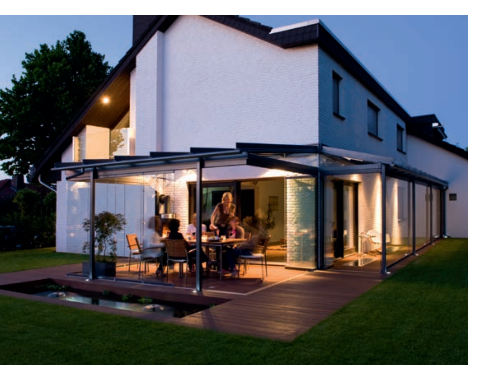
GLASS CANOPIES & GLASS HOUSES